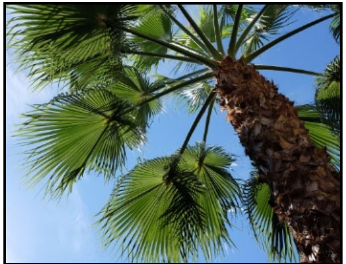
Palm tree ( http://mrg.bz/rS403A )