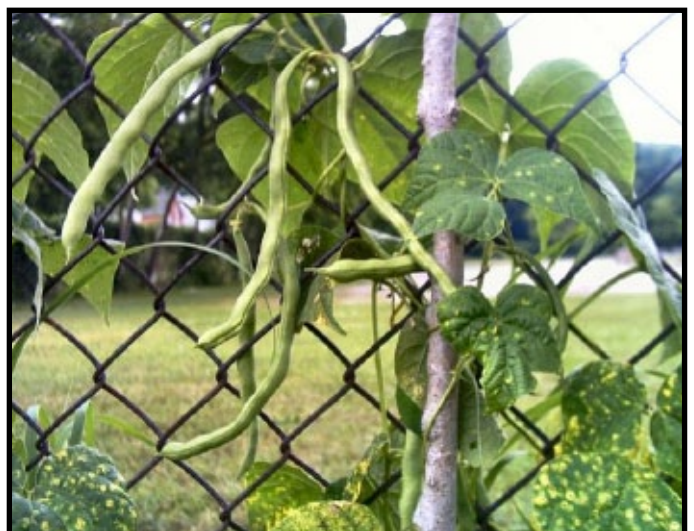
Green beans ( http://mrg.bz/vGrhGb )