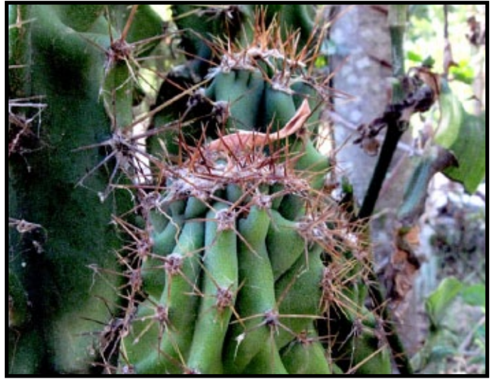
Prickles ( http://mrg.bz/2IPf5R )